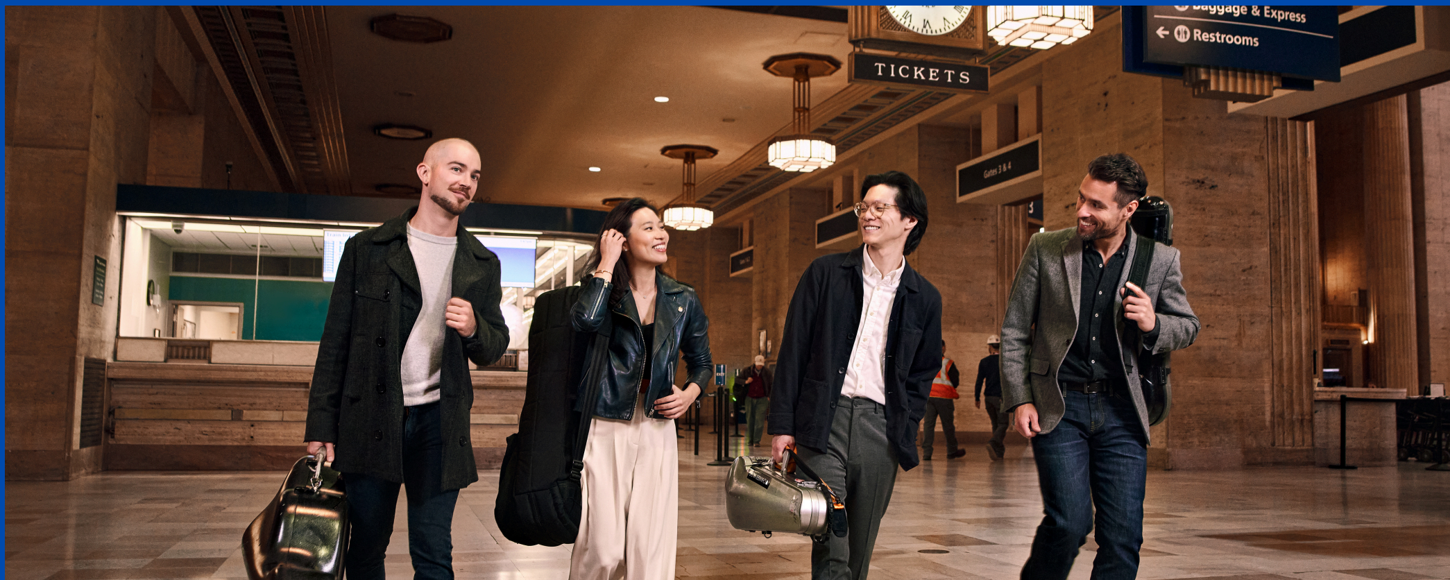
Dover Quartet.